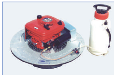
Model 30-L Liquid System