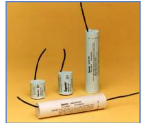
Classic Smoke Candles

Superior ® Classic Smoke Candles quickly and efficiently produce a dense white smoke ideal for smoke testing. Disposable and simple to use, no external power or heat source is required. Due to its high visibility and excellent persistence, Classic Smoke provides the best results, allowing you to locate difficult leaks at greater distances when Sewer Testing.