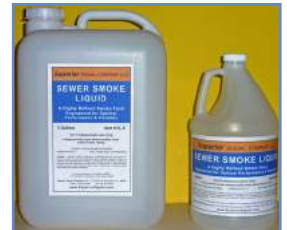
Superior Smoke Fluid

Superior ® Smoke Blowers are engineered to maximize dry smoke output, eliminating the wet smoke and mess typical of other liquid smoke systems. Superior ® Smoke Fluid Systems use micro-control flow valves, custom-machined stainless steel injector nozzles, and custom-welded double-insulated heating chambers to generate the maximum volume of dry smoke.