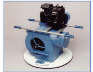
Model 20-S Smoke Blower